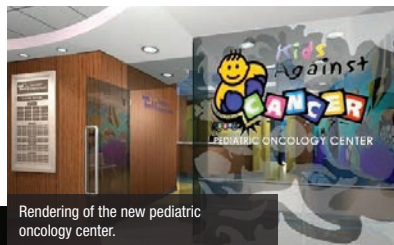
Rendering of the new pediatric oncology center.