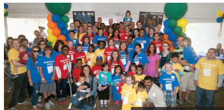
Over 600 pediatric cancer survivors and family members joined together at Eisenhower Park for this annual event to celebrate survivorship.