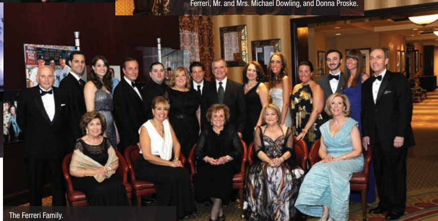
The Ferreri Family.