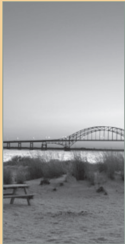
With its sights set on improvement and innovation, Southside Hospital continues to transform, keeping pace with ground-breaking developments in the diagnosis and treatment of life-threatening diseases as they evolve before our very eyes, transporting us to new levels of management and care.