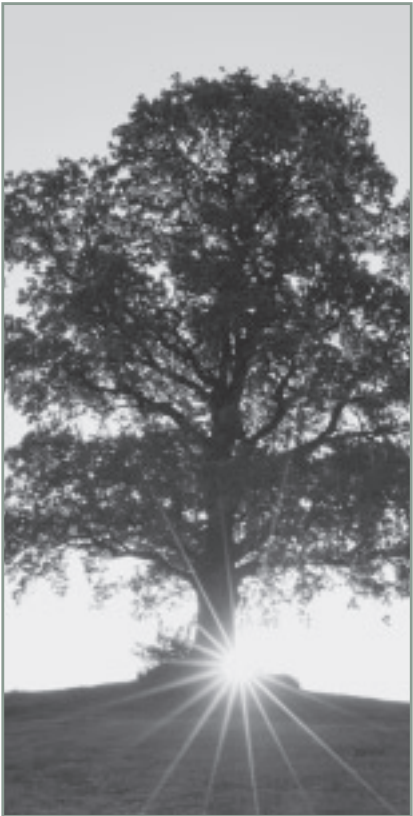
As sure as the sun rises and sets, Southside Hospital strengthens its deep roots in the community each and every day with a renewed commitment to responsive, patient-centered healthcare in your neighborhood.