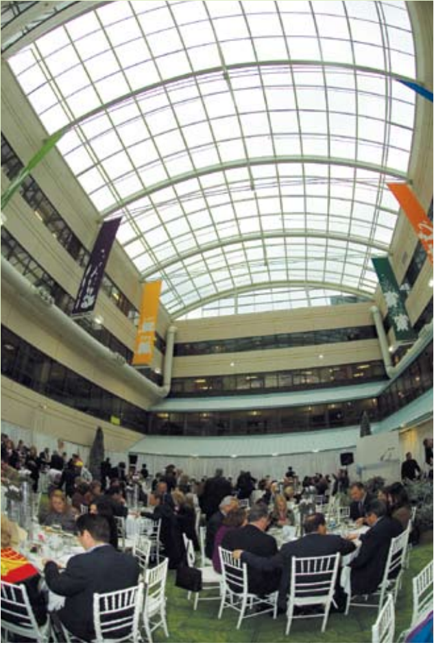
The four-story, glass-enclosed CA Wellness Center.

+ Learn how you can support Schneider Children’s Hospital by visiting http://support.northshorelij.com/schneider .