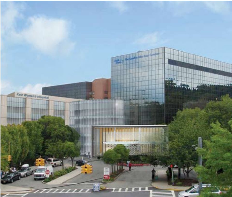
Exterior view of the Katz Women's Hospital at North Shore University Hospital.