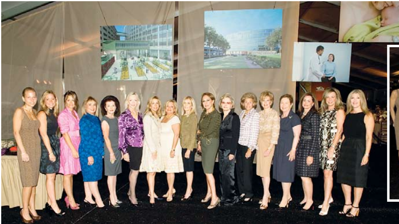
Members of the Luncheon Committee of the Partners Council for Women's Health.