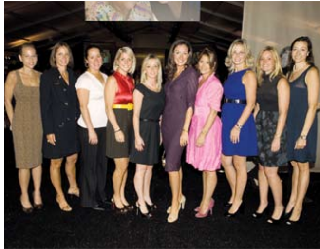
Members of the Junior Committee of the Partners Council for Women's Health.

The Partners Council for Women's Health recently held its 16th Annual Fall Luncheon & Fashion Show at Old Westbury Gardens. The glamorous afternoon, sponsored by Americana Manhasset and featuring the fashions of Bottega Veneta, attracted 560 guests and raised a total of more than $475,000 that will go toward the establishment of the Katz Women's Hospital. Emmy