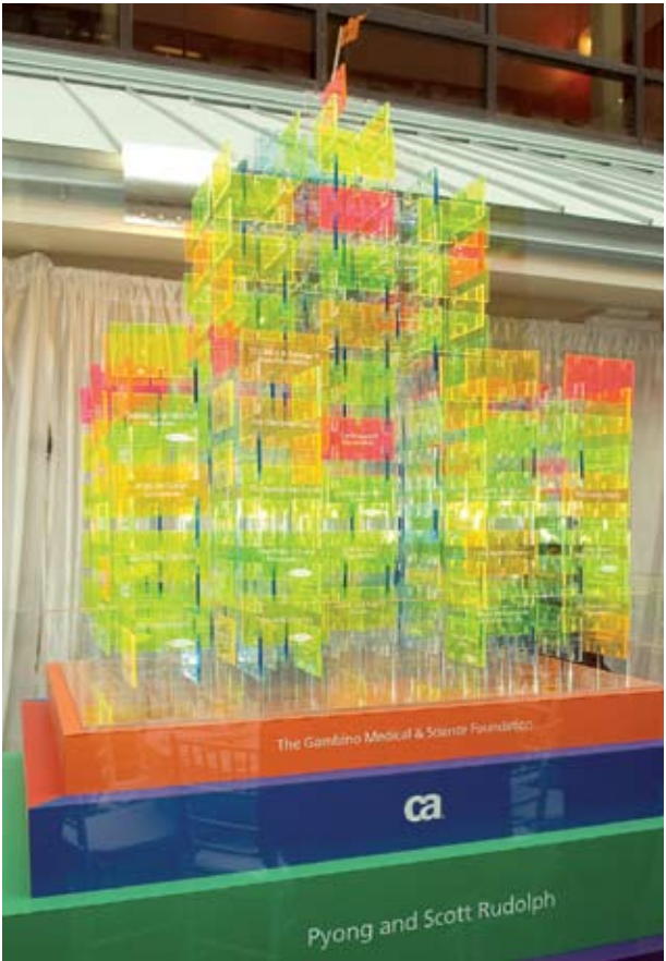
The new Schneider Children’s Hospital donor recognition tower.