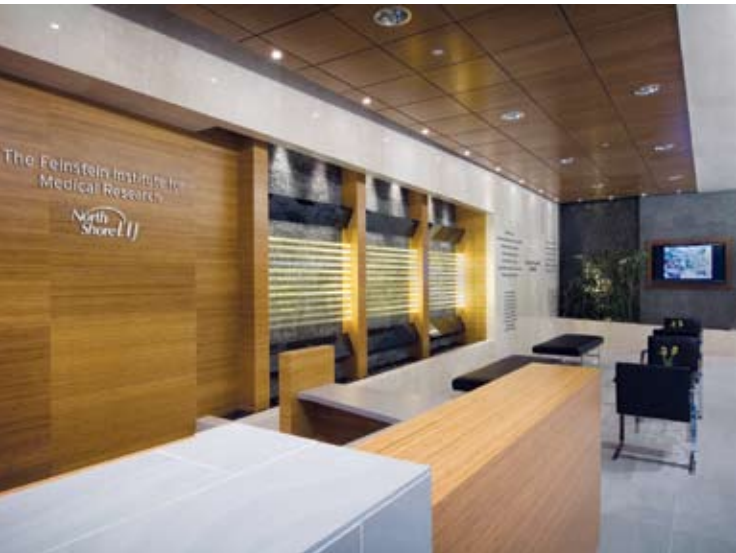
Lobby and donor recognition wall.