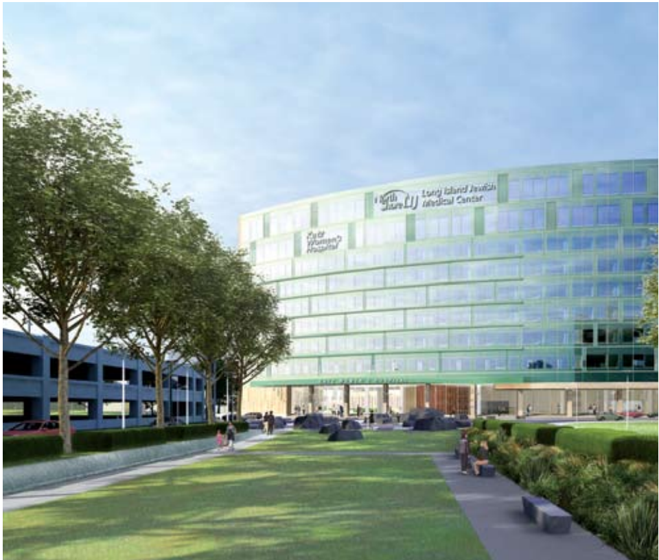
The new inpatient tower at LIJ Medical Center, home of the Katz Women's Hospital.