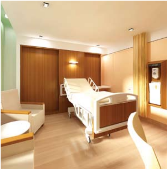
Katz Women’s Hospital patient room.