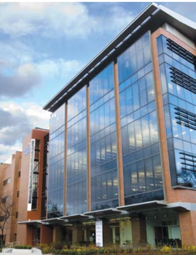
Exterior of the new wing.