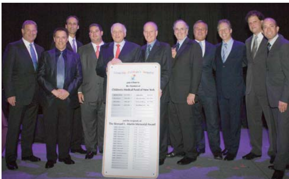
Past recipients of the Bernard L. Martin Memorial Award, given annually to a member of the Children’s Medical Fund of New York Men’s Division who best exemplifies commitment to children’s healthcare.