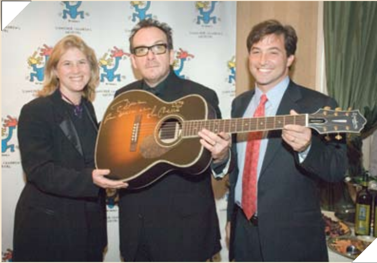
Musician Elvis Costello (center), who performed during the evening, with the auction winners of an autographed guitar.